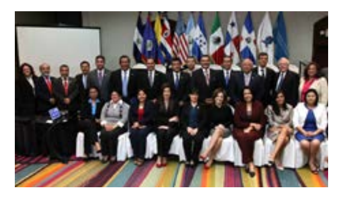
PGA's Seminar on Equality and Non-Discrimination for Latin American and Caribbean Parliamentarians held in El Salvador on 3 November 2014 called for an open dialogue among legislators, NHRIs and LGBTI civil society to review national legislation on gender identity, hate crimes and non-discrimination. The San Salvador Statement of Commitment was adopted shortly thereafter.

Violence against LGBTI community members and impunity of the attacks perpetrated by private actors, particularly gangs and the police, are an ongoing issue in El Salvador. The criminal justice system has failed to recognize and investigate LGBTI hate crimes, thereby rendering individuals vulnerable to attack and without redress. In particular, transgender individuals have been the targets of brutal murders. Most of these cases are not investigated and none have resulted in a successful prosecution.