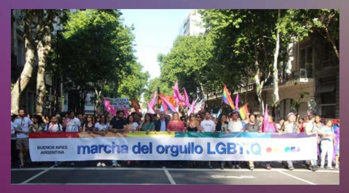
María Rachid and Jorge Taiana, Members of the Legislature of the city of Buenos Aires, march together with LGBTI organizations and activists in the Pride Parade in Buenos Aires, Argentina, on 7 November 2015.

Moreover, cooperation between parliamentarians and civil society organizations sends a powerful message to the broader public that representatives and constituents can work together to protect the human rights of all individuals regardless of their sexual orientation and gender identity.