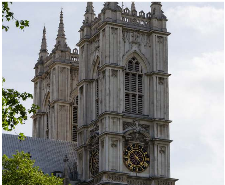
The Palace of Westminster, also known as the Houses of Parliament, in London, England.

“These limitations impacted the ability of governments to manage their responses in a transparent and accountable manner, thereby jeopardizing the effectiveness and impact of their responses to the crisis.”