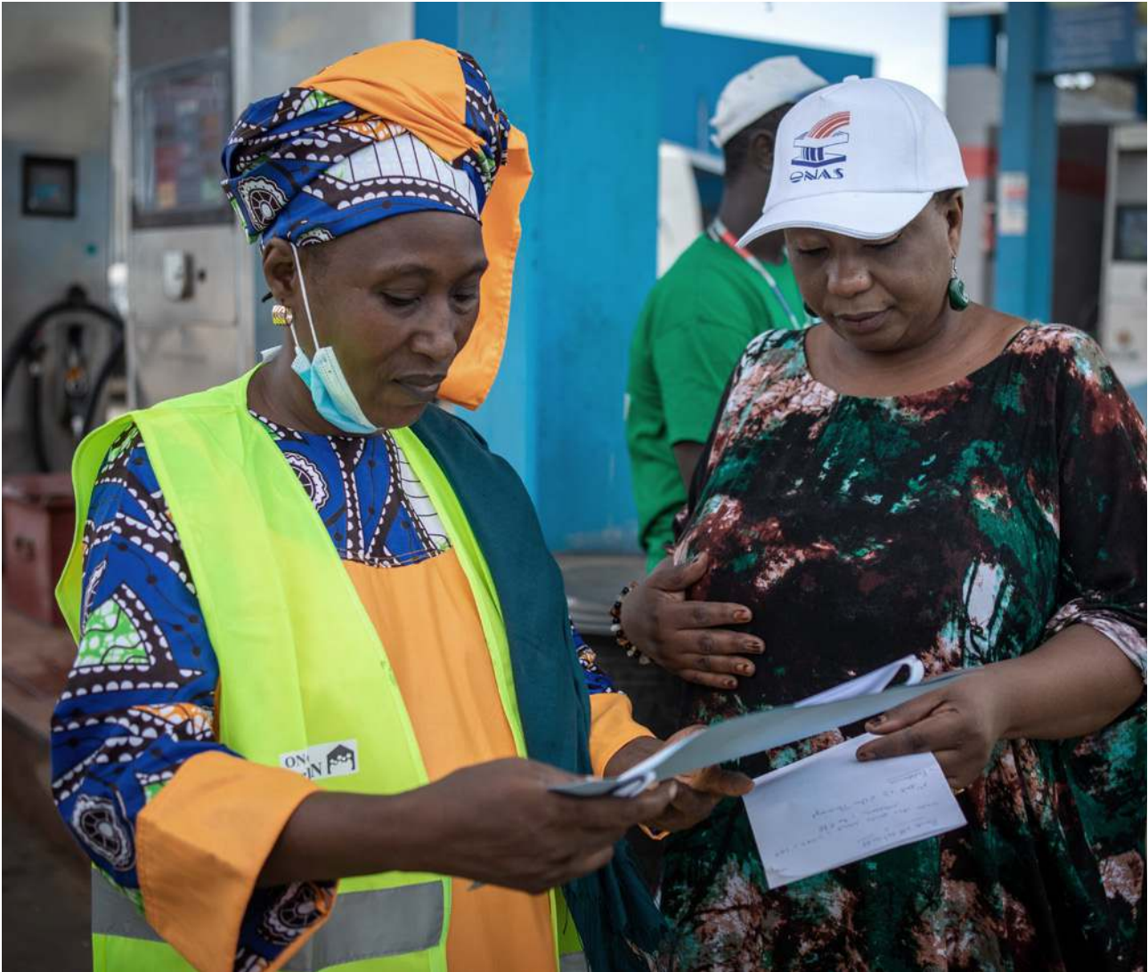
Officials from the National Sanitation Office of Senegal during a site inspection in Pekine, Dakar.

make space for historically marginalized voices to be heard—they ensure scarce resources are used wisely. Accounting for the differentiated impact of emergencies on women and ensuring their voices and interests are considered during crisis response not only addresses gender inequality, but also creates a path for a smoother recovery. 21 And when speed and accountability are pursued together, the public can access improved services, which builds confidence that the government can deliver. Public trust is critical to recover and renew societies after COVID.