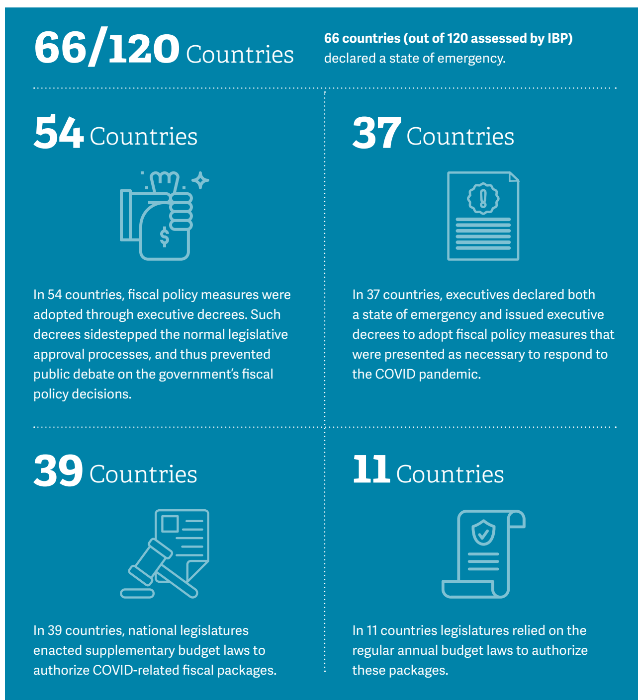
Table 1. Executive decrees limited legislative budget oversight

IBP conducted a rapid assessment of 120 countries' performance on transparency, oversight and public participation in COVID relief packages, which covered the role played by national legislatures in overseeing the emergency. This and other research underscored that normal legislative approval processes and public debates, particularly regarding important emergency fiscal packages, were hampered by the declaration of states of emergency and issuance of important decisions through executive decree (see table 1 below).