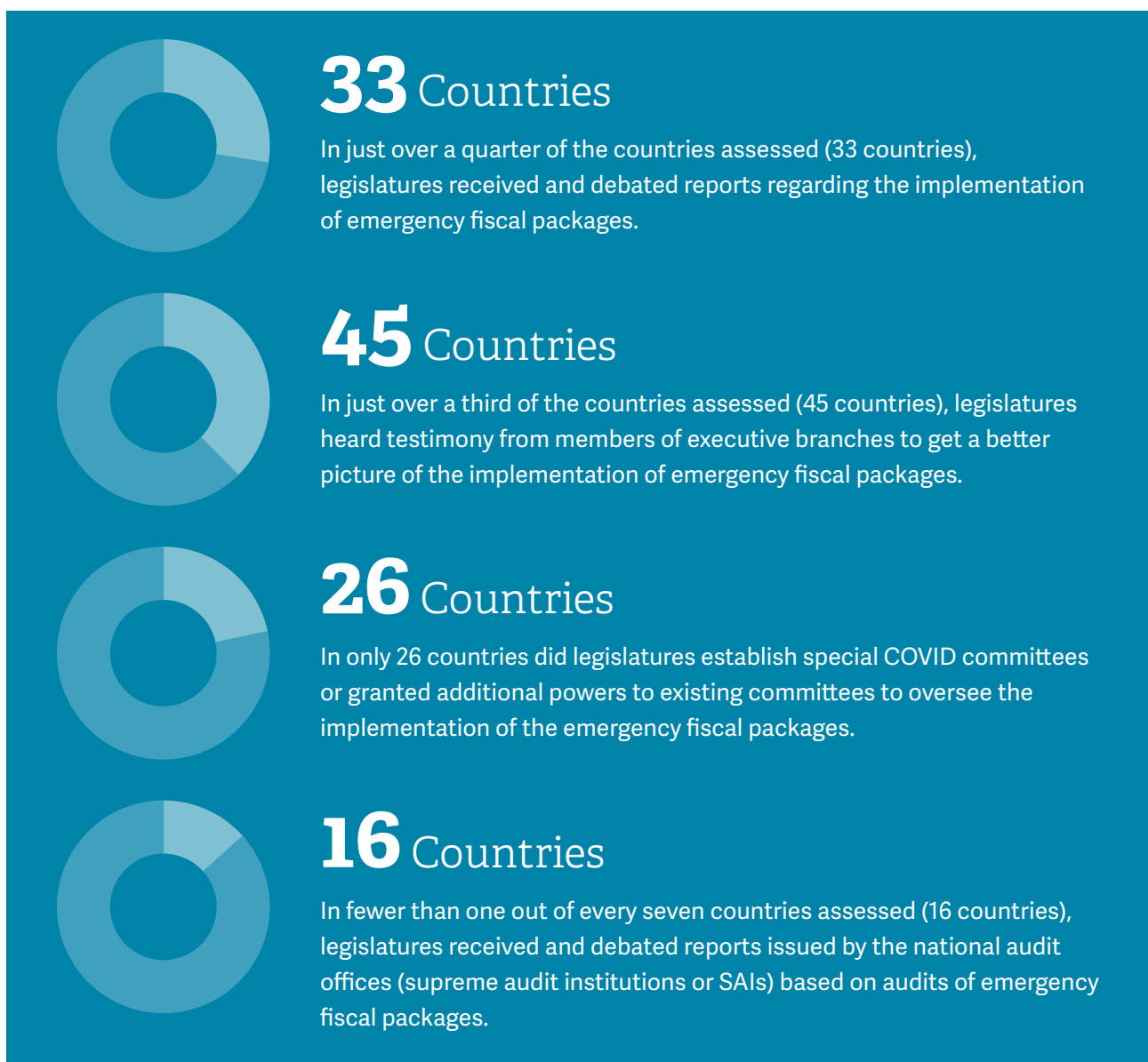
Table 3. Few legislatures were actively tracking the implementation of emergency fiscal measures

Source: " Managing Covid Funds: The accountability gap ", International Budget Partnership, 2021.