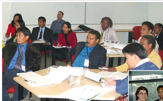
▼▼▼ Participants and guests at the RPG opening reception on 3 Sep-