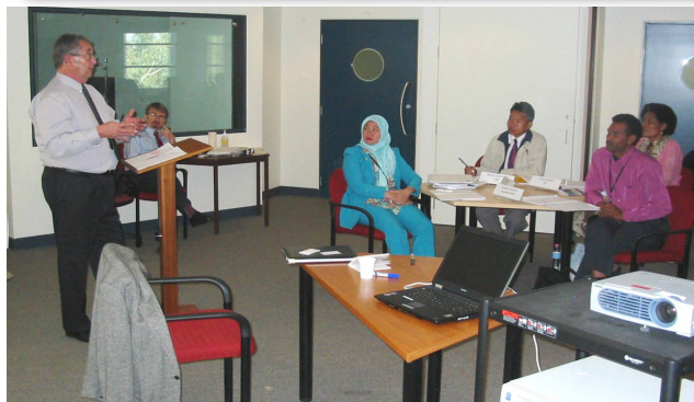
▲ RPG Class of 2007