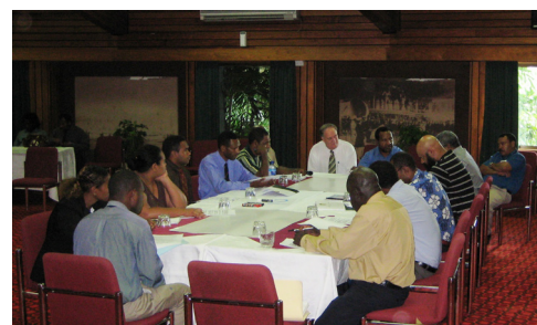
▲ Workshop Day 2 - Members and staff formed in committees and working through practical exercises.

Presentations were also given on the purpose of committees, what makes an effective committee, obstacles to effective committee work