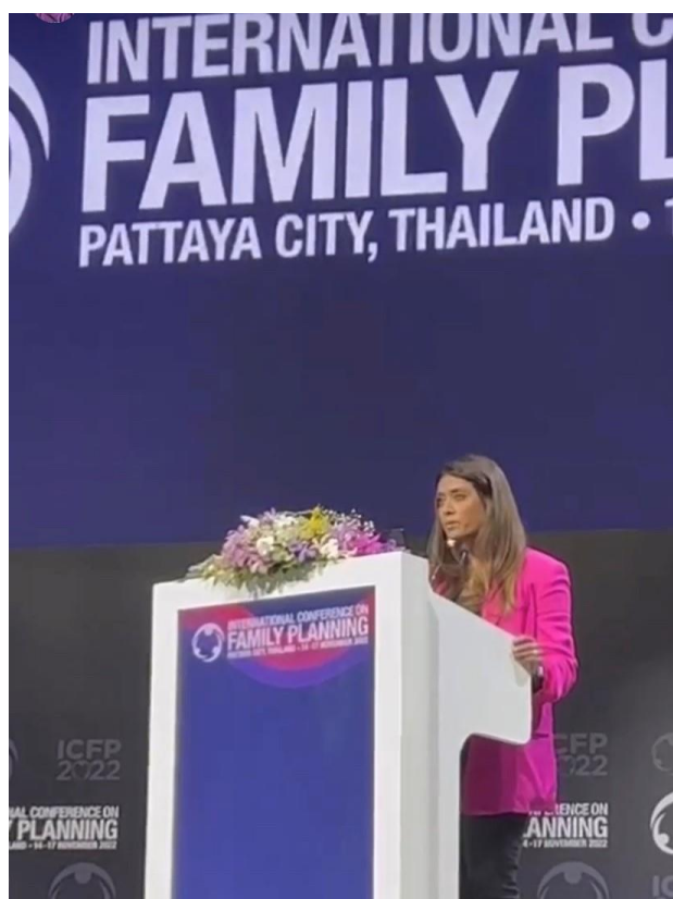
Hon. Prisca Thévenot (MP France) during the ICFP closing ceremony

As we conclude 2022 and look to the future, it is important to be aware of the rapid approaching SDG deadline of 2030. There is still much work to be done in FP, and the role of parliamentarians is central to making sure that no woman or girl must endure an unmet need. Parliamentarians need to be aware – and more importantly, engaged – of what their own parliaments are discussing with respect to FP as well as how future development aid budgets are drafted. Furthermore, partnerships with organisations such as the UNFPA and WHO, as well as private entities, are crucial to parliamentary work being effectively implemented in the field.