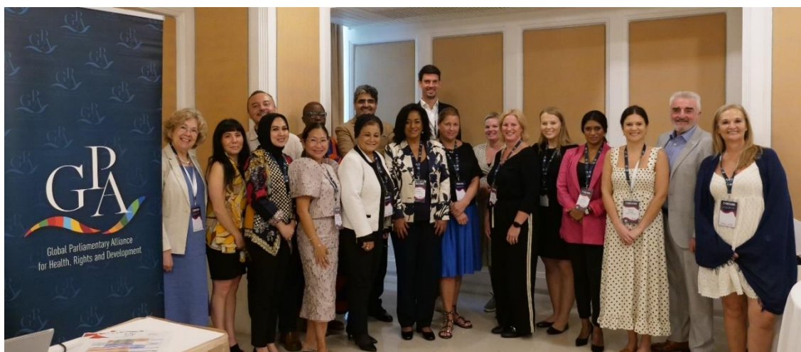
The GPA Delegation

The European Parliamentary Forum for Sexual and Reproductive Rights (EPF) is grateful for the financial support received by UNFPA and WHO through its Human Reproduction Programme (HRP) to organise this event.