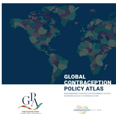
Leaflet of the Global Contraception Policy Atlas