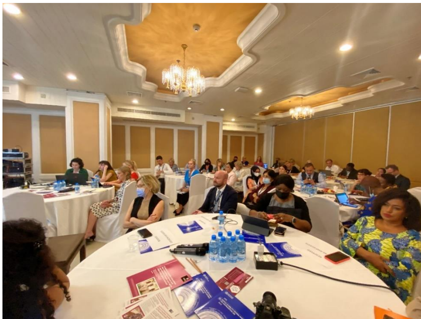
The GPA Forum (Day 2)

Throughout the conference, all the MPs from the GPA delegation learned by listening to the best practices of other countries as well as sharing their own concerns and problems at the national level with their peers. The value of north-north, south-south, and north-south exchanges remains of vital