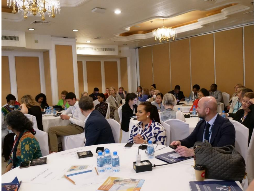
The GPA Forum (day 1)

language shifted to explaining the importance of dedicating time and money to one child at a time, then the entire community reacted positively to FP and spacing pregnancies for the health of the mother and child.