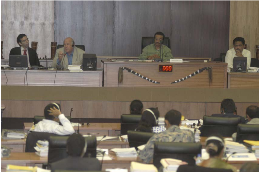
Mr. Francisco Guterres "Lu-Olo", Speaker of the Parliament of Timor-Leste