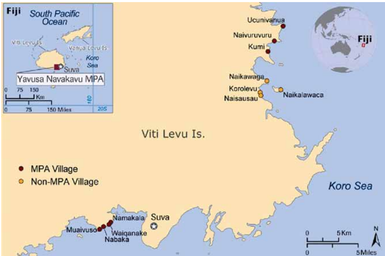
Figure 1: Navakavu Yavusa Indigenous Community.

The Navakavu Yavusa indigenous community is located on Viti Levu Island in Fiji, 13km from the capital of Suva within the Rewa province of Suva. Navakavu Yavusa is a traditionally linked clan that consists of three villages and two settlements: Muaivusu, Nabaka, Waiqanake, Namakala and Ucuinivanua. The territory is formally owned by the community in accordance with tribal law where 80% of the Fiji is under formal