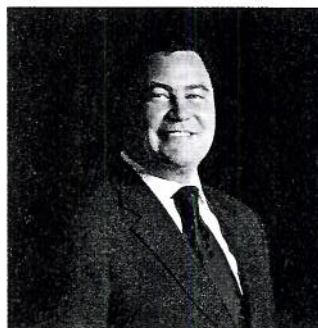
Mr Charles Chauvel

Despite constituting half of the world's population, women continue to be disproportionately under-represented in governance and at all levels of decision-making. Last year, a milestone 2 was reached in women's participation in Parliaments, with one in five MPs in the world now being female. However gender equality in politics is still a distant reality in most countries. Progress has been slow toward achieving even the minimum target of 30 per cent representation of women in national Parliaments, regarded as a "critical mass" 3 level of representation. As of 1 December