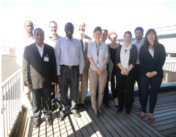
Participants at the Task Team Meeting in Oslo

The Task Team will meet again in October to prepare suggestions for necessary amendments to the tool. When revising the tool, the Task Team is paying due consideration to striking the right balance between