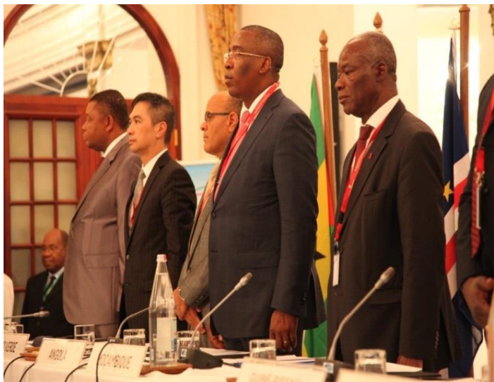
Representatives at the IV OISC/CPLP General Assembly.

The first Portuguese SAI PMF training course was a pilot version endorsed by the Brazilian Federal Court of Accounts in collaboration with IDI. It took place in May 2014, in Brazil, and was attended by 12 representatives from SAIs from the Portuguese-speaking African Countries (PALOP) and Timor-Leste sponsored by the project to be trained as trainers. The training also generated feedback to improve and customize the SAI PMF modules to the reality of the PALOP and Timor-Leste. The second training took place in Mozambique, from 8 to 12 June 2015, back-to-back with the IV OISC/CPLP General Assembly (GA). 20 auditors attended the training aimed to enhance training skills and develop a pool of Portuguese SAI PMF trainers able to train other professionals. The course resources were translated with Pro PALOP-TL SAI funding.