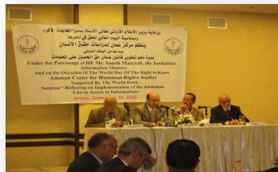
Seminar: Reflecting on the Implementation of the Jordanian Law to Guarantee the Right of Access to Information

Additionally, the event included a ceremony to announce the winners of an essay contest in celebration of RTK Day. The essay contest targeted law and journalism students, challenging them to write about the benefits of the Jordanian law to guarantee the right of access to information. Finally, ACHRS launched a campaign featuring promotional materials such as t-shirts, caps, stickers, and other items to get the word out about the importance of the law.