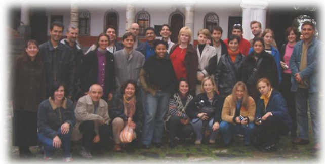
Right to Know Meeting, Sofia, Bulgaria, 2002

important developments at the international level. The UN Human Rights Committee 7 recognizes information as a human right as do decisions at the Inter-American Court of Human Rights and the European Court of Human Rights. That this right has been recognized both by laws and in the courts to such a significant extent is in large part thanks to advocates who have pushed hard for such protection and recognition.