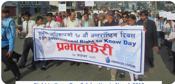
Right to Know Day Celebration in Nepal, 2012

In this vein, progress in promoting the right to information this year was evident in the range of innovative activities, from civil society-led actions to inform citizens held on the streets, to events held inside parliaments. In some cases, key alliances are being made between groups and institutions that play different roles in the promotion and enforcement of the right to know. For example, the European Ombudsman