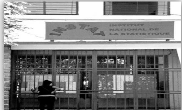
"The other access" by Ranaivosoa Tolojanahary, Antananarivo, Madagascar

Today, some of the strongest calls for the right to information come from regions outside of Europe. South Asia, for example has experienced a notable groundswell. Of the nearly 100 participants in the international “I have a right to know!” photography contest, FOIANet received more entries from India than from any other country. 14 The photographs are a fascinating window into the activity, energy, and enthusiasm for the right to information in this country. The 2 nd and 3 rd place winners in the contest were from India; the winner, shown below, came from Madagascar.