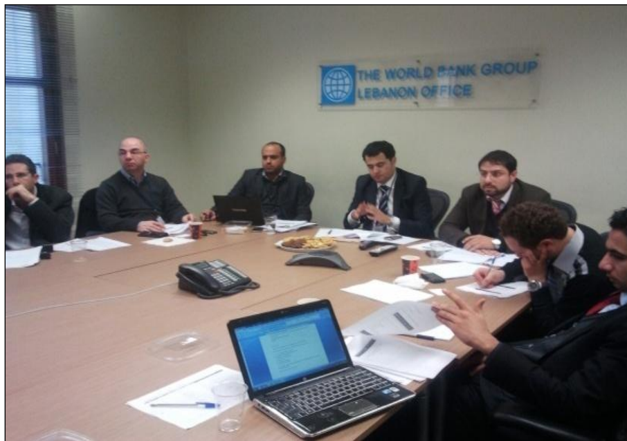
World Bank office in Beirut, 6 March 2012.

Mendel concluded by highlighting the importance of international initiatives like the Open Government