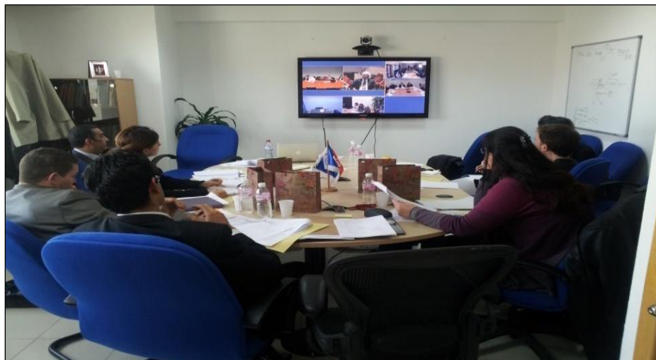
The World Bank office in Tunis, 6 March 2012.