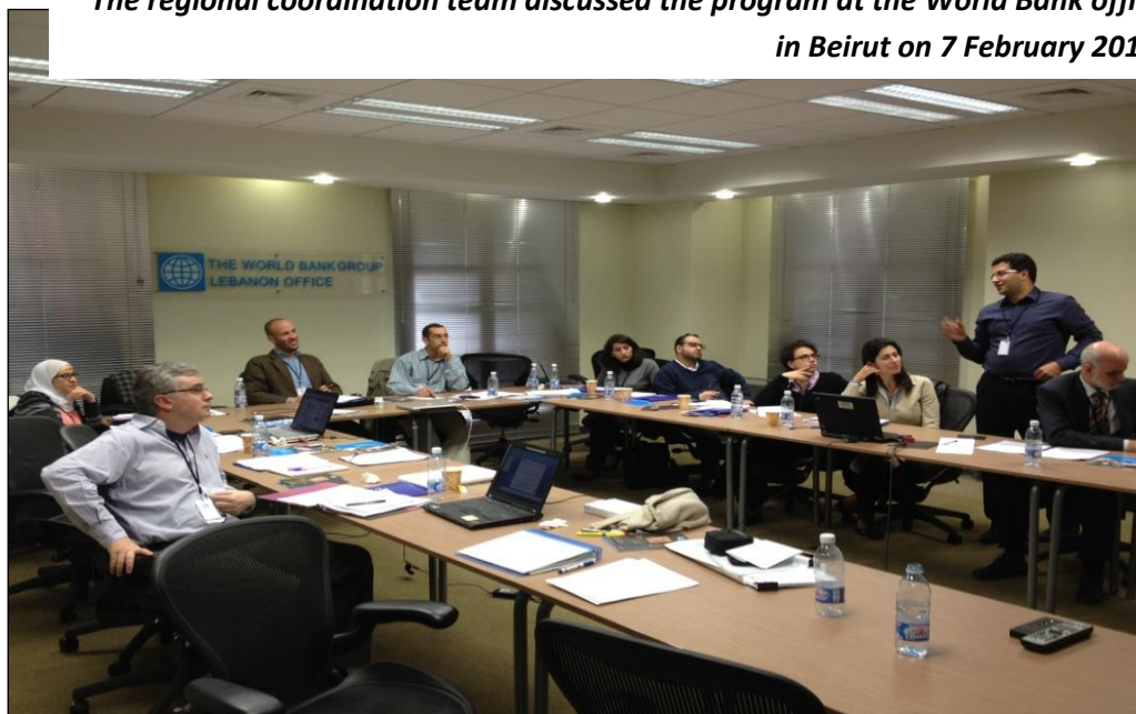
The regional coordination team discussed the program at the World Bank office in Beirut on 7 February 2012.

https://www.facebook.com /pages/Access-to- Information-in-MENA- region/247240672021898