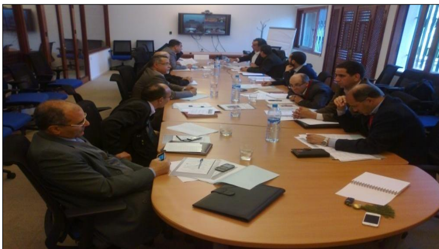
The World Bank office in Rabat, 6 March 2012.

However, in order for ATI to achieve its potential the legal framework should possess certain key features. Mendel explained the importance of having an independent administrative oversight body as one of the main features of ATI legislation. Other key features to strengthen ATI legislation are: a clear list of exceptions; a set of information request procedures, a broad presumption in favor of disclosure, along with a clear recognition of the scope of information covered, the included mandated bodies, and who may make requests; proactive disclosure; the existence of sanctions for non-compliance; and promotional measures toward public awareness, capacity-building and training.