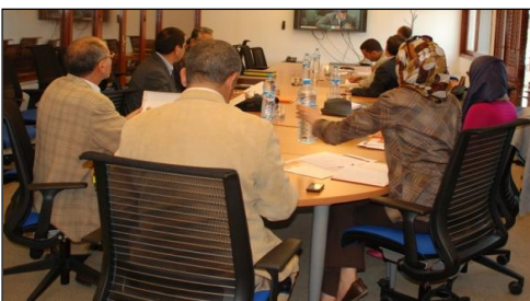
The World Bank office in Rabat, 24 April, 2012

Some challenges highlighted by participants to ATI in Lebanon include: political, legal, and administrative constraints. In terms of political constraints, there is limited political will to pass an ATI law. In 2009 there was a coalition including representatives from various organizations and institutions (LebPAC, the Ministry of Justice, the Ministry of Finance, the Ministry of Economy and Trade, the Syndicate of Journalists, etc) working on ATI. Furthermore, a draft access to information and whistleblower protection legislation was presented to the relevant Parliamentary Commission, however, this was not tabled for discussion in the Lebanese Parliament. . There are currently no discussions with parliamentary committees and government officials on the ATI bill. Hence, citizens' right to claim access to information is at a standstill. With regards to legal constraints, there are some conflicting laws. For example there is legislation that forbids release of information without permission from the ministry. Finally, related to administrative constraints, as participants highlighted, database management is limited and administrative rules are not simple.