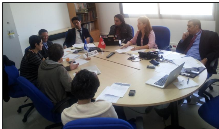
The World Bank office in Tunis, 24 April 2012.

With regards to implementation, a coalition was formed in 2008 but it is not clear what has been the impact of the coalition's work to advance access to information or monitoring its implementation. One of the challenges highlighted by participants was the limited funding available to undertake awareness-raising and to help with the high court fees. Additional support would enable more CSOs—especially women's groups—to understand the benefits of using ATI, thus promoting better implementation. Local ownership was also underscored as an important element to foster effective ATI. Finally, civil society organizations need to engage with other actors, such as government, and political parties, as well as design a solid action plan to move ahead ATI in Jordan.