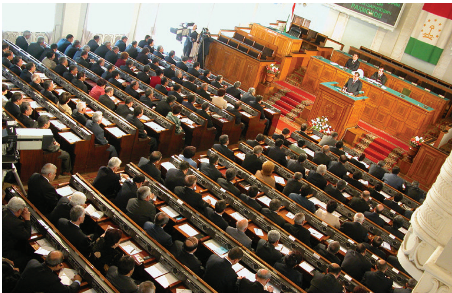
Photo: Tajikistan Parliament, Tajikistan.

Building support for legal and policy reform often requires a long-term strategic effort and sustained advocacy with parliamentarians. Effective advocacy requires an understanding of the parliamentarian's home constituency. This involves understanding how the parliamentarian wields leadership in the community, and identifying key influential supporters as well as potential impediments to action. Civil society allies living in these communities can often provide nuanced information regarding the best approach to engaging with parliamentarians.