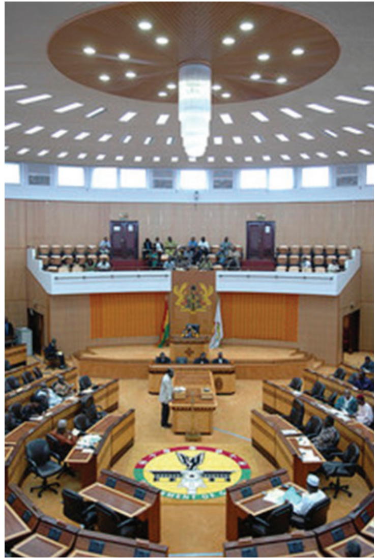
Lawmakers meet during a session of Parliament in Accra, Ghana, June 16, 2006.

Direct oversight: Beyond enacting legislation and approving national budgets, most legislative bodies in parliamentary and presidential systems play an ongoing role in overseeing executive branch activities. In some cases, opportunities for direct oversight may arise during the normal legislative process, such as when executive officials are summoned to provide annual reports of government activities and plans for the coming year. Frequently, oversight may occur at the prompting of members of parliament who wish to follow up on issues raised in a briefing, meeting or event. Members of parliament may also be inspired to exercise their oversight authority in response to a media story or at the request of a constituent or advocacy group.