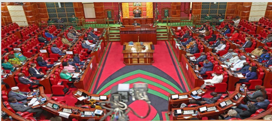
Image: Parliamentarians' dialogue at the Africa Climate Summit.

In the lead up to the ACS and the Parliamentary Dialogue the Kenyan Senate on 31 August 2023 passed the Climate Change (Amendment) Bill, 2023, to amongst others, provide a legal framework for carbon trading as a vital tool to achieve emissions reduction targets and to fulfil commitments outlined in international climate agreements. 1 In the wake of the ACS, MPs championing climate change moved motions to table the outcome of the dialogue in their respective parliaments. International summits clearly serve as catalysts for parliaments to demonstrate their political leadership and commitment to climate action.